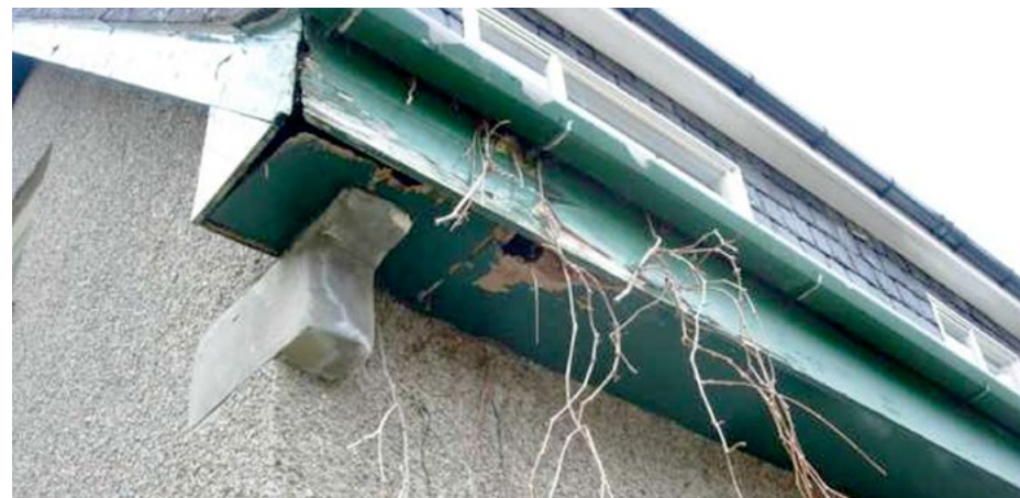
Photo: A potential access hole for a marten in a rotten soffit © Hugh Brown